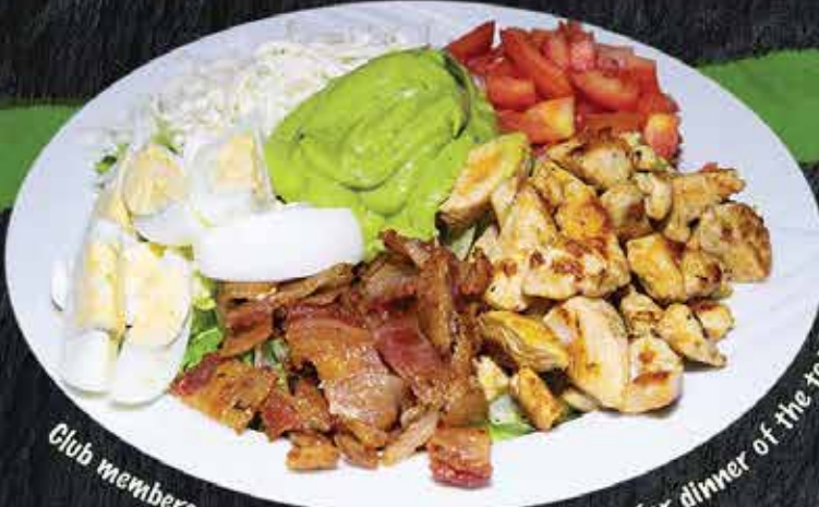
Club members get $1.00 discount for lunch, $2.00 for dinner of the total receipt.

Make any sandwich a wrap or any wrap a sandwich! All sandwiches come with crinkle fries.